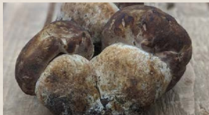
DRIED & FROZEN EUROPEAN CEPES