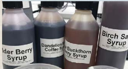
SYRUPS AND SALTS