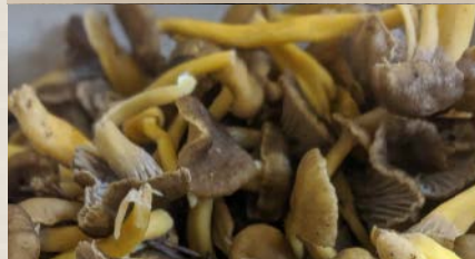
CHANTERELLE GREY LEG