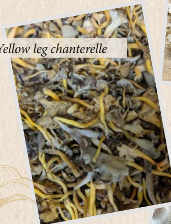
Yellow leg chanterelle